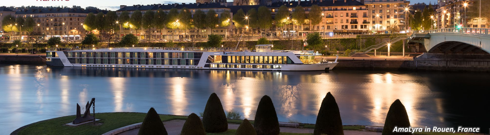
Amalyra in Rouen, France

ABOARD AMALYRA • 7 NIGHTS • JULY 4 TO 11, 2024